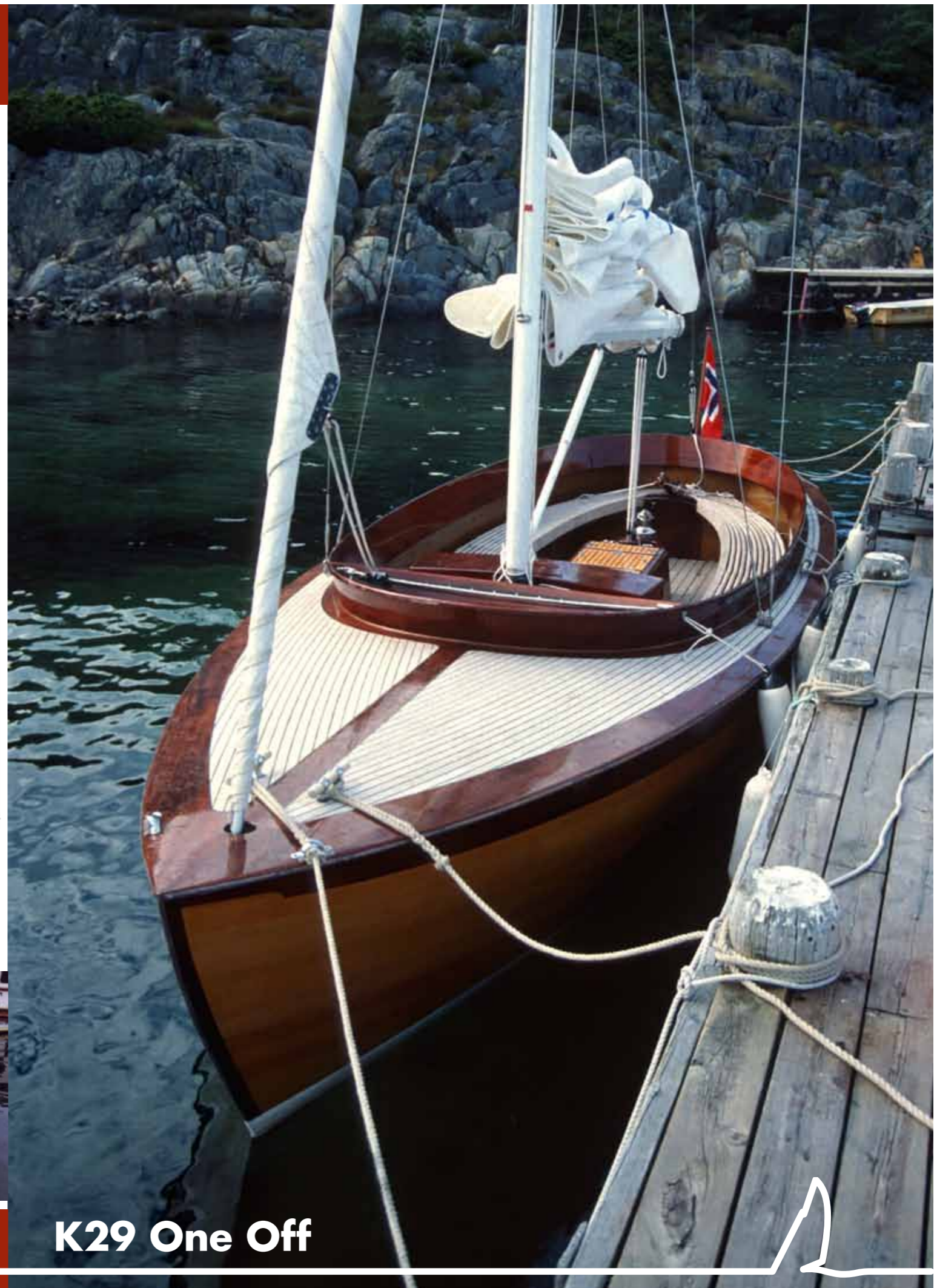
Photo © BKD, Seilas, Seilmagasinet. Photo shows one off. Equipment or specification subject to change without notice. © Birger Kullmann Design. All rights reserved