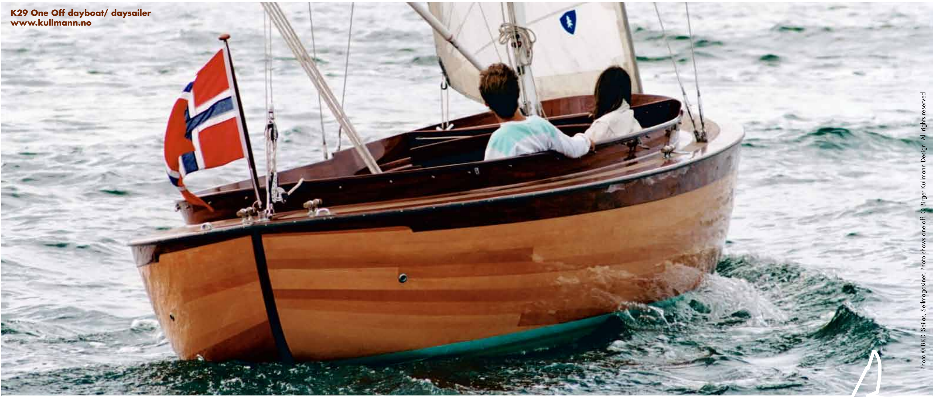
Photo shows one off.

K29 One Off dayboat/ daysailer www.kullmann.no