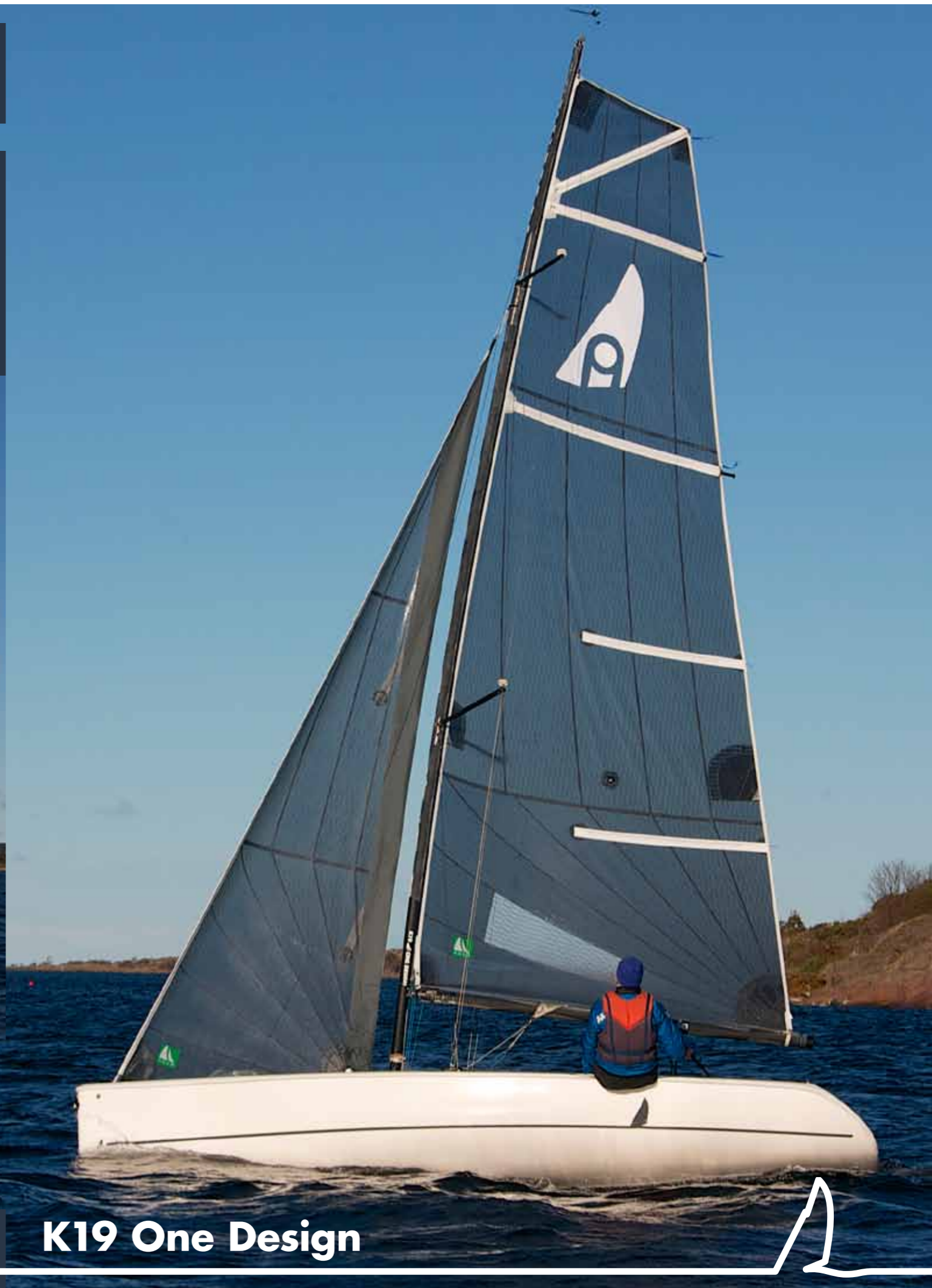
Photo of the boat sailing shows prototype. © Birger Kullmann Design