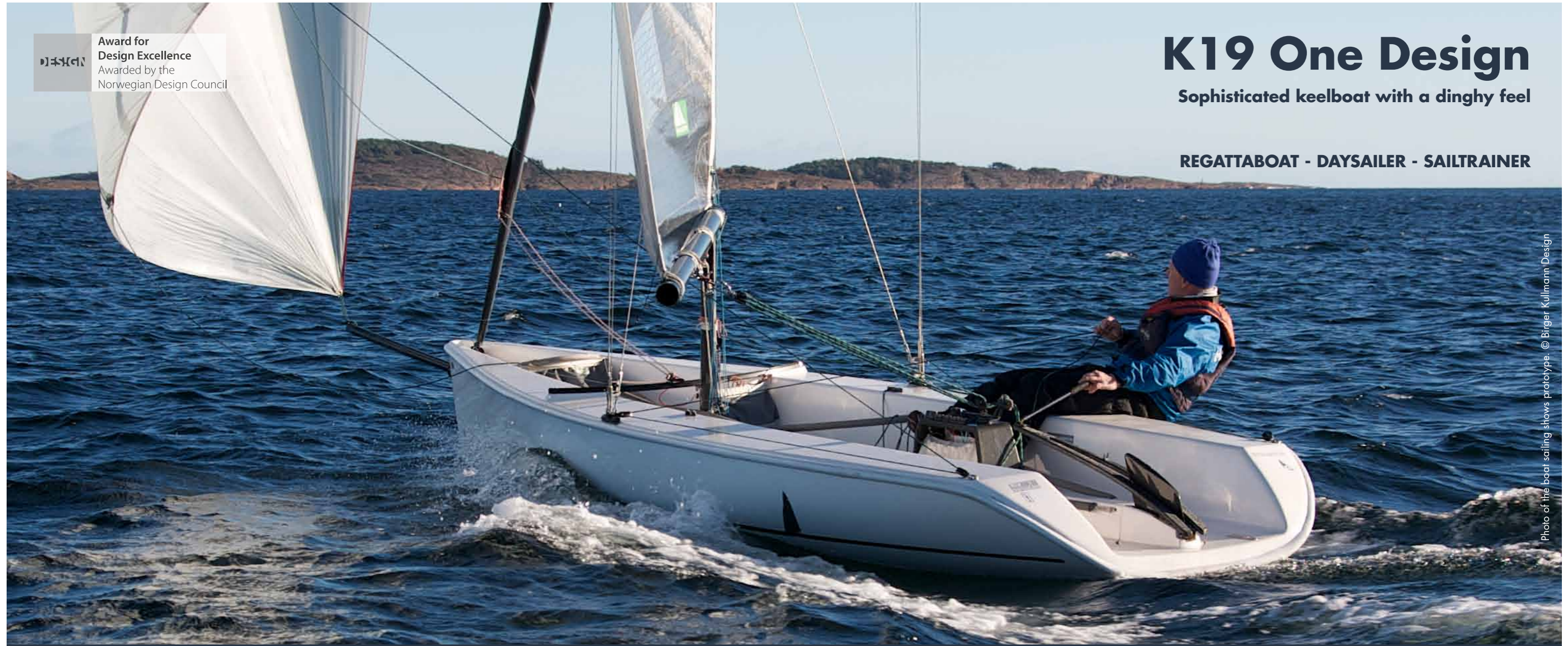
Photo of the boat sailing shows prototype.

Fast and challenging for the experienced, easy and safe to handle for beginners. An easily handled boat both for a young dinghy sailor as well as for seasoned keelboat sailors. Sail the K19 singlehanded or with a mixed crew of two or more. For racing it is unique in being a two person keelboat. The K19 is not a dinghy with a bolt on keel, but more like a micro offshore racer with a proper deck to sit on and all sheets and control lines within arms reach.