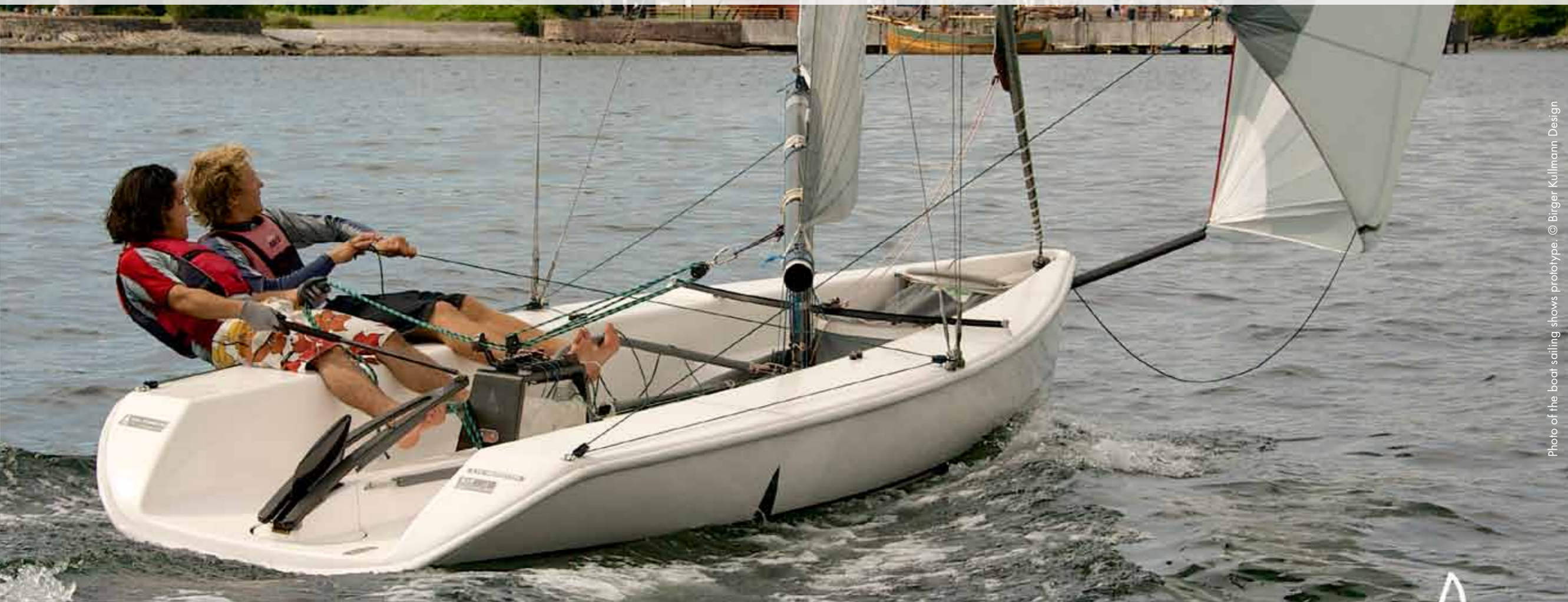
Photo of the boat sailing shows prototype.