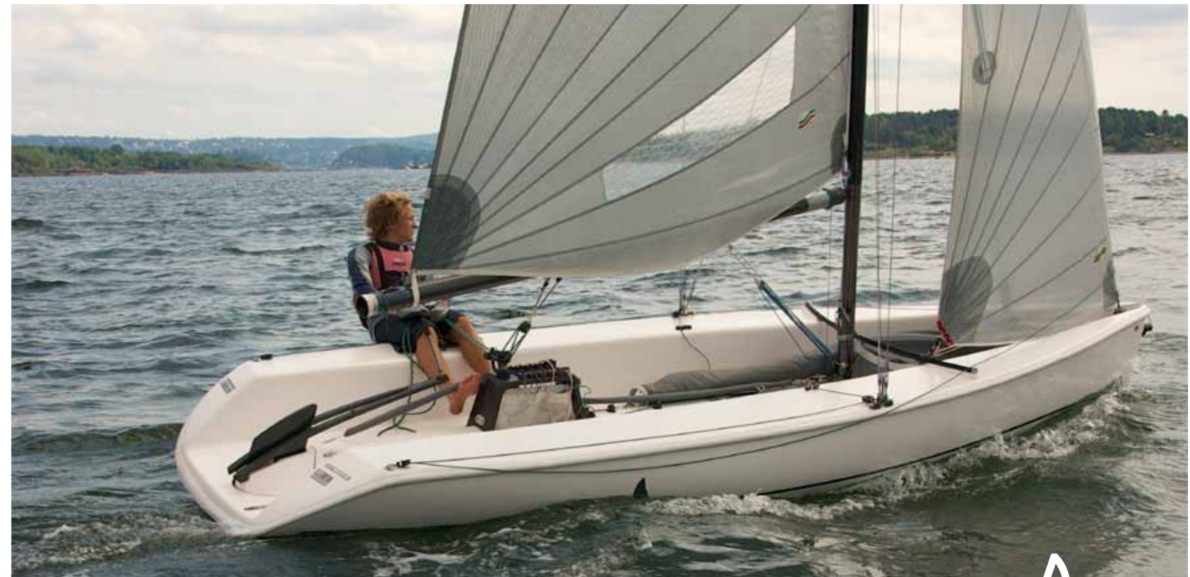
Photo of the boat sailing shows prototype.