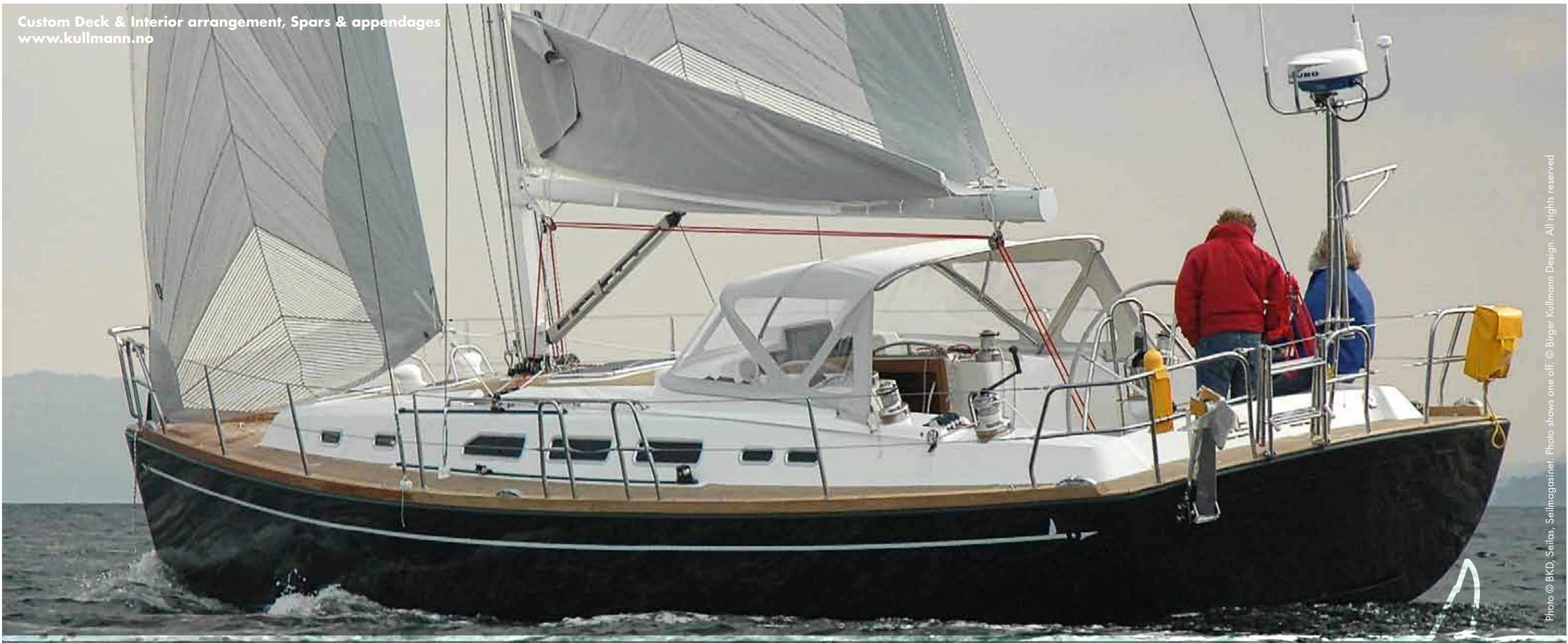
Photo © BKD, Seilas, Seilmagasinet. Photo shows one off. © Birger Kullmann Design. All rights reserved

Concept: "Timeless classic looks" in a modern hull and rig package. An easily handled multipurpose performer to be sailed by a small crew for short and long distance cruising and to be converted to handicap racing mode with little effort. Lay-out to be functional at sea using proven design and systems - paying no attention to "fashion and trends".