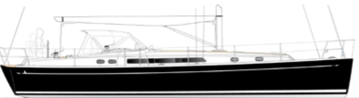
Positive Transom Version