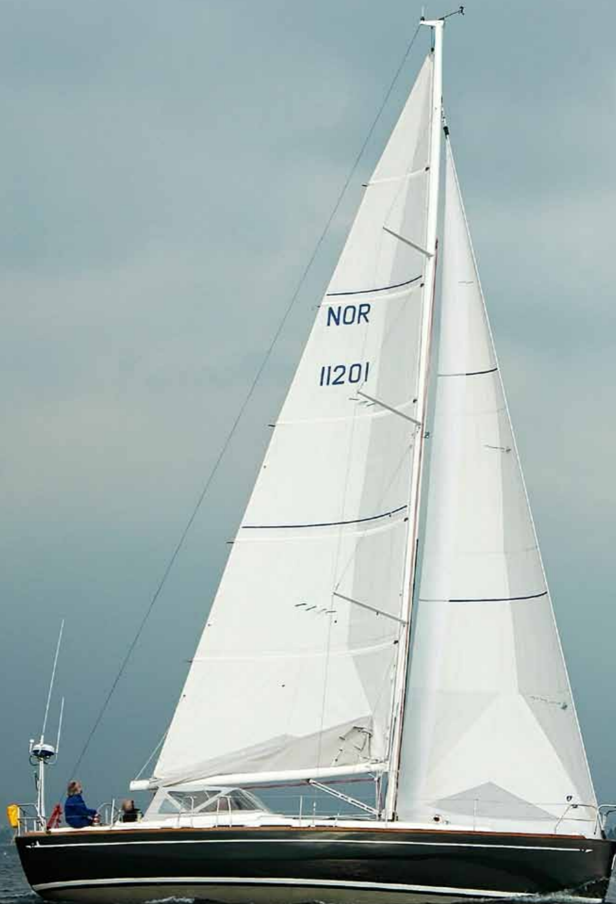
Photo © BKD, Seilas, Seilmagasinet. Photo shows one off. Equipment or specification subject to change without notice. © Birger Kullmann Design. All rights reserved